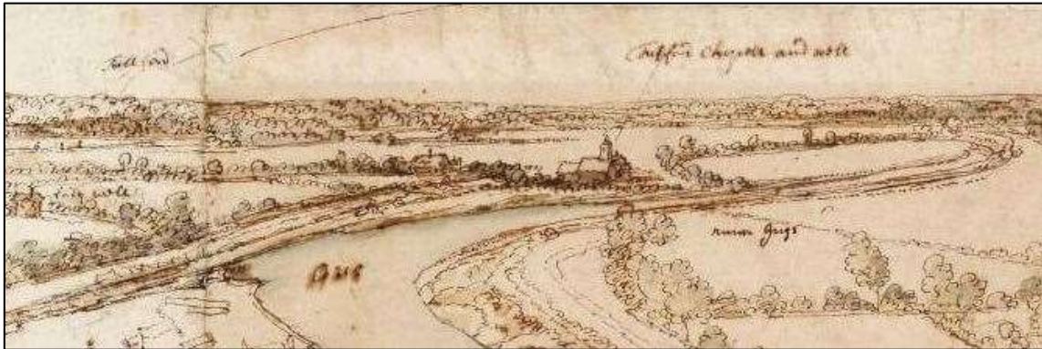
Francis Place: Panoramic view looking south from Clifford's Tower. 1705

In 1869 Well House, its buildings and land, was purchased and demolished to extend the graveyard of St. Oswald's to the south. At the same time a wall was built around the south and west sides to a height intended to avoid the problems of flooding and erosion in the graveyard. The conveyance document describes the buildings being sold as, "a cottage/tenement, the barn, stables and hereditaments" (anything subject to inheritance). This can be easily identified on the 1852 OS Map, which clearly shows buildings, grouped around a small yard. Standing separate from this group, and sited approximately where the early 20thC lych gate now stands was a large, square building of approx 9m sq. (30 feet sq). This building may be what remained of the bathhouse, although its use or function still remains a mystery.