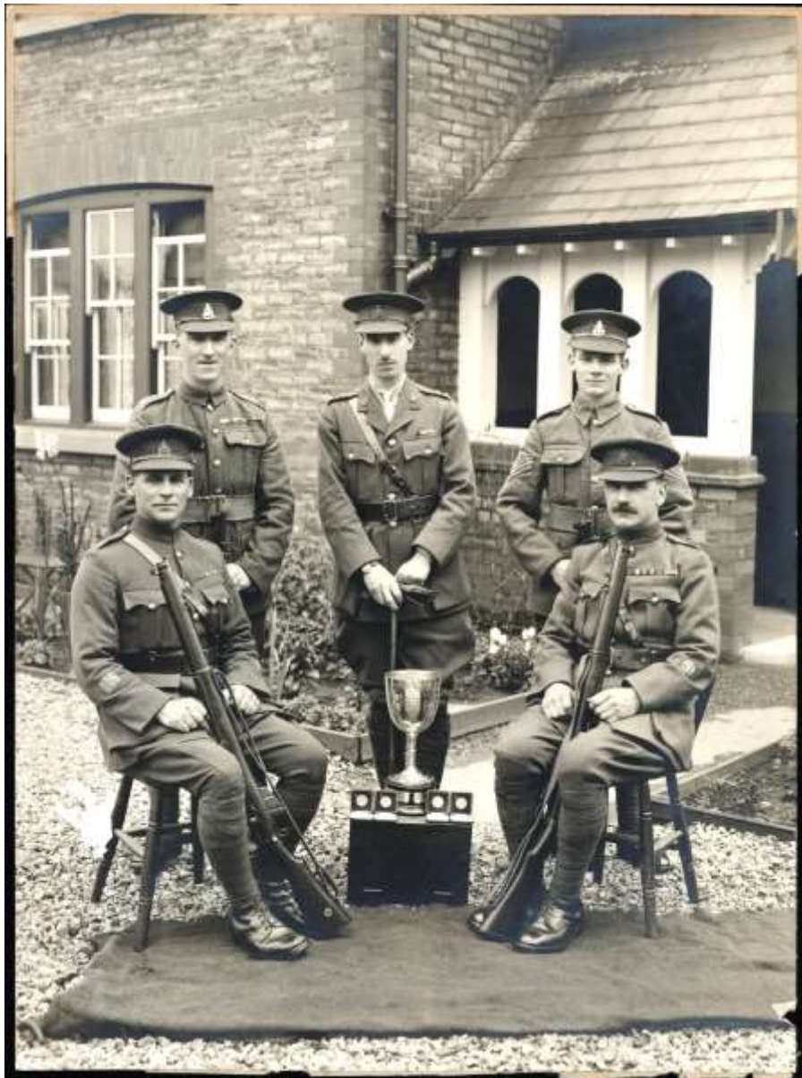
Winners of the RAOC Trophy in 1924, outside the Arts and Crafts House