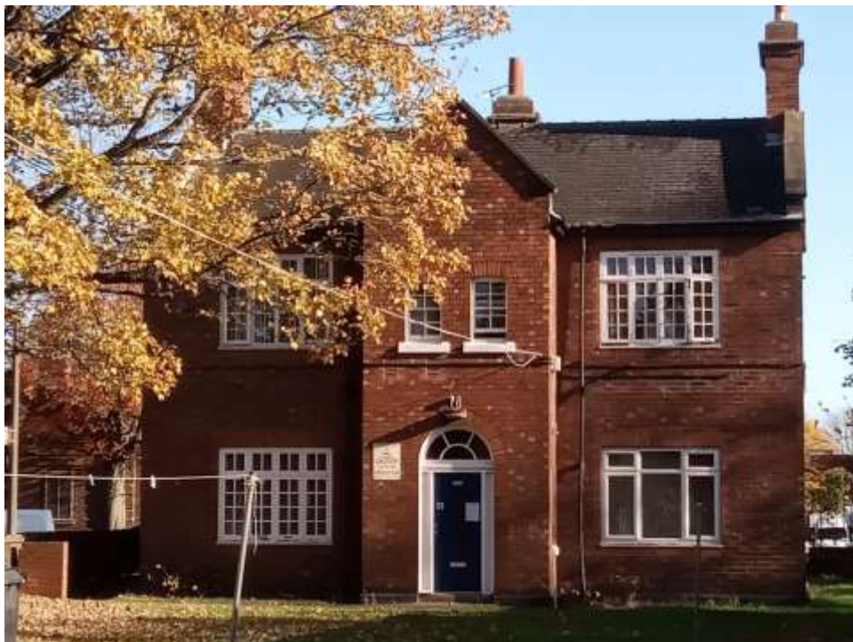
The First House in Ordnance Lane