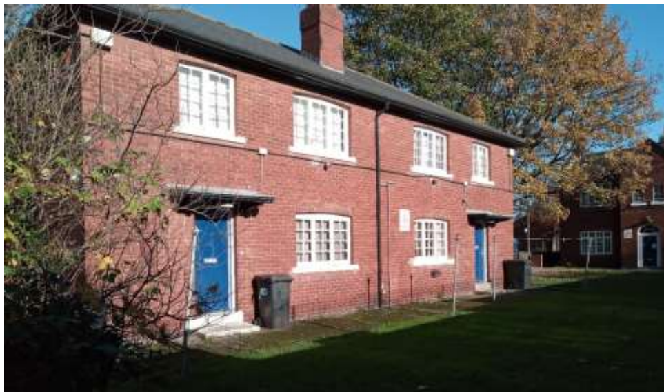
The Semi-Detached Houses in Ordnance Lane