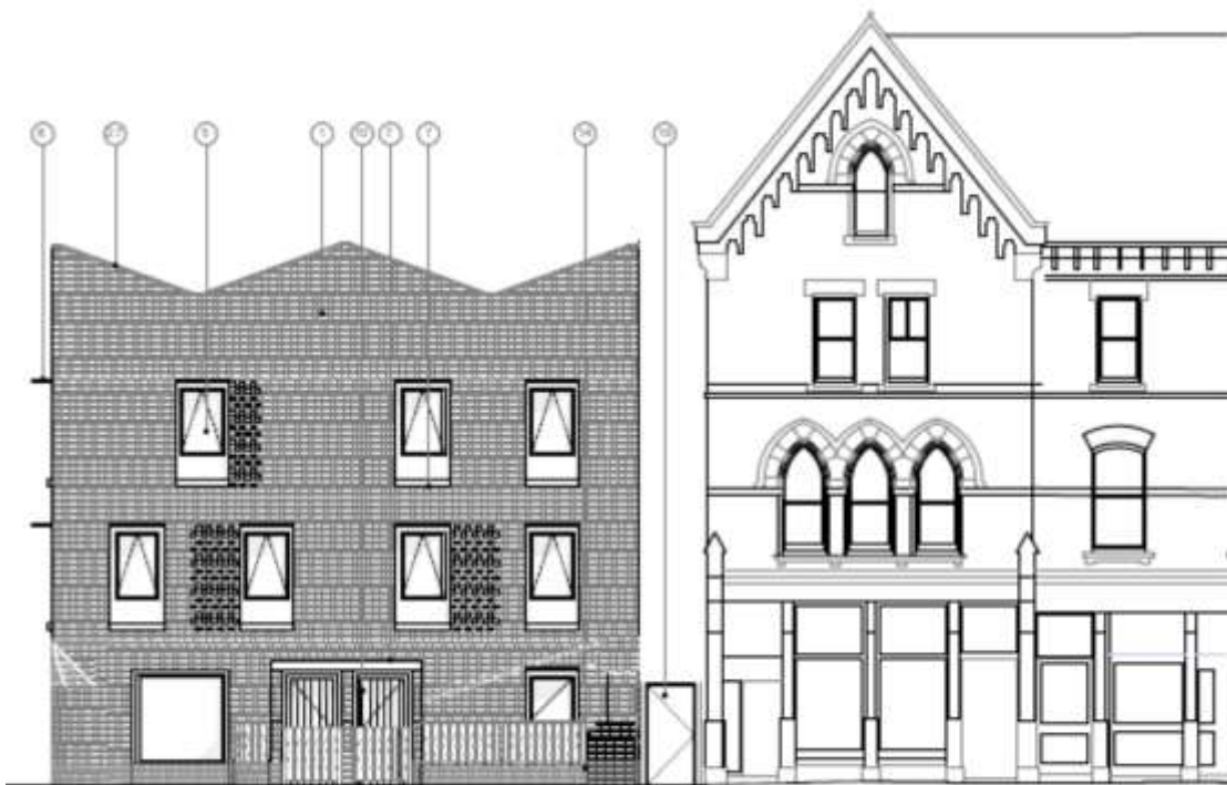
Elevation of New Houses in Fulford Road, adjoining Wenlock Buildings (Sainsbury's)