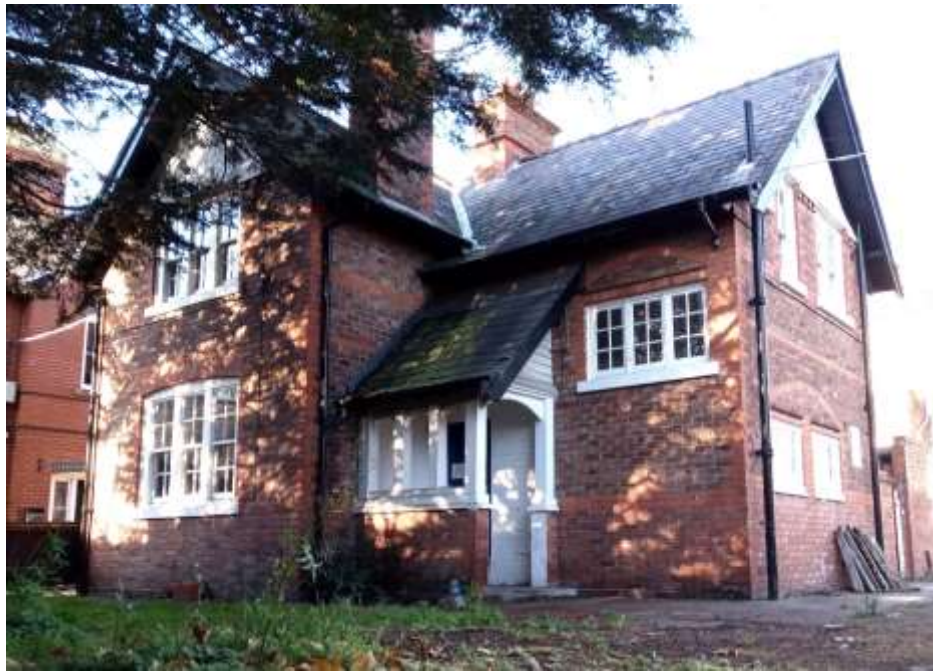
The Arts and Crafts House in Ordnance Lane

Fishergate, Fulford and Heslington Local History Society call on the council to instigate a redesign of this part of the project, so that all or the houses, or at least the Arts and Crafts house is retained.